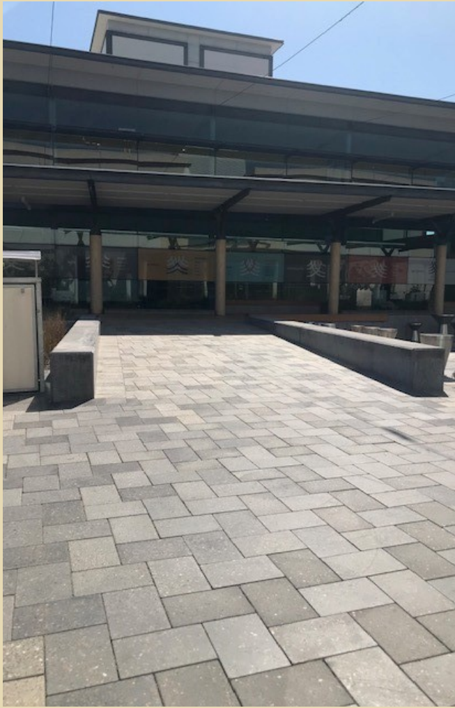
The outside of Mandurah Performing Arts Centre looks like this.